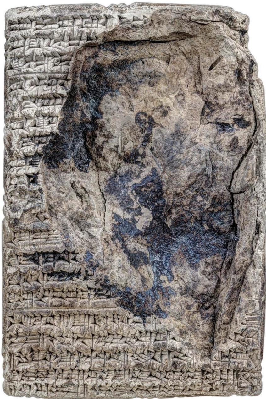
Fig. 1. Fragmentary obverse of the house sale contract YBC 7424 (Yale Oriental Series 17 3) from the third year of Babylonian king Nebuchadnezzar II, famous for burning the city of Jerusalem and exiling the Judean elite as described in the Book of Kings.

in digital form. For similar unsupervised language modeling tasks in English, for example, one can collect practically endless amounts of texts online, and the main limitation is the computational challenge of storing and processing large quantities of data (7). For cuneiform texts this is not the case. Automatic optical character recognition cannot be used to reliably identify cuneiform signs, neither in their two-dimensional (2D) representations (hand copies) nor in three-dimensional (3D) scans of actual clay tablets (8–12). Various visual recognition algorithms are being applied to cuneiform, but the results are yet in their infancy (13–16). Therefore, one has to rely on a limited corpus of manually transliterated texts. Although Akkadian cuneiform texts span more than two millennia and the genres available for study are heterogeneous, for many periods, only a